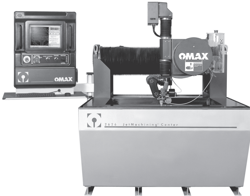
Shown with Tilt-A-Jet® Accessory.